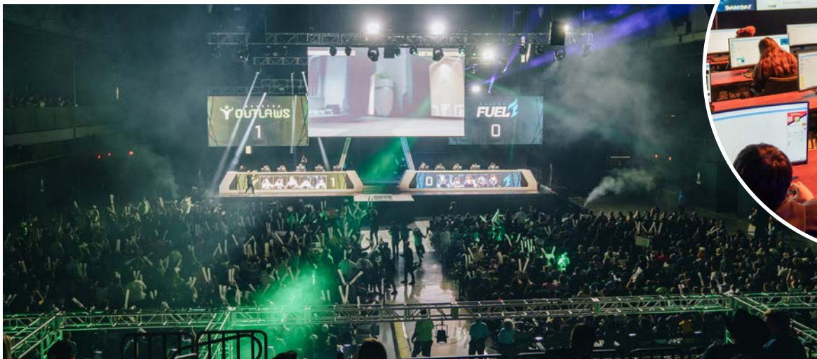
Above: The technology / esports arena at the Boeing Center at Tech Port.